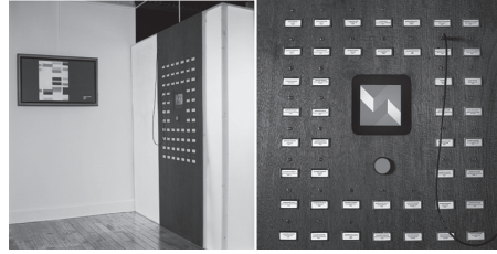
Figure 3: Jon Alpert, Eric Green, Betsy Seder and Victoria Westhead, Connections (2001). Left: The Connections prototype with display monitor and a model of the interaction wall. Right: Detail of the Connections interaction wall with “image” sockets, cable, and preview screen.

The models for ‘public curation’ outlined above still consist of pre-defined archives but blur the boundaries between public and curator, allowing for models that potentially could establish a more direct reflection of the demands, tastes, and approaches of an audience. Due to the increasing development and popularity of mobile technologies, public response to and discussion of art has also begun to evolve on a self-organised grass-roots level. Students of Marymount Manhattan College recently created ‘unofficial’ audio tours for artworks at New York’s Museum of Modern Art in the form of podcasts, and made their MoMA Audio Guides (2005) 18 available at the website of Art Mobs, 19 an organisation dedicated to exploring the intersection of communication, art, and mobile technology. The public is invited to create their own audio guides and submit them to the site.