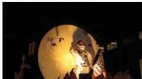
It was a cool, crisp night on Friday, perfect for the...