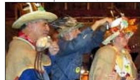
Floridians celebrity their roots on Saturday at the...