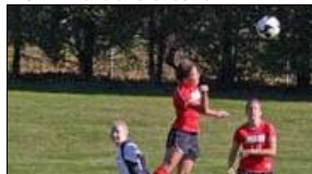
The fourth seeded Bridgewater State University Bears...