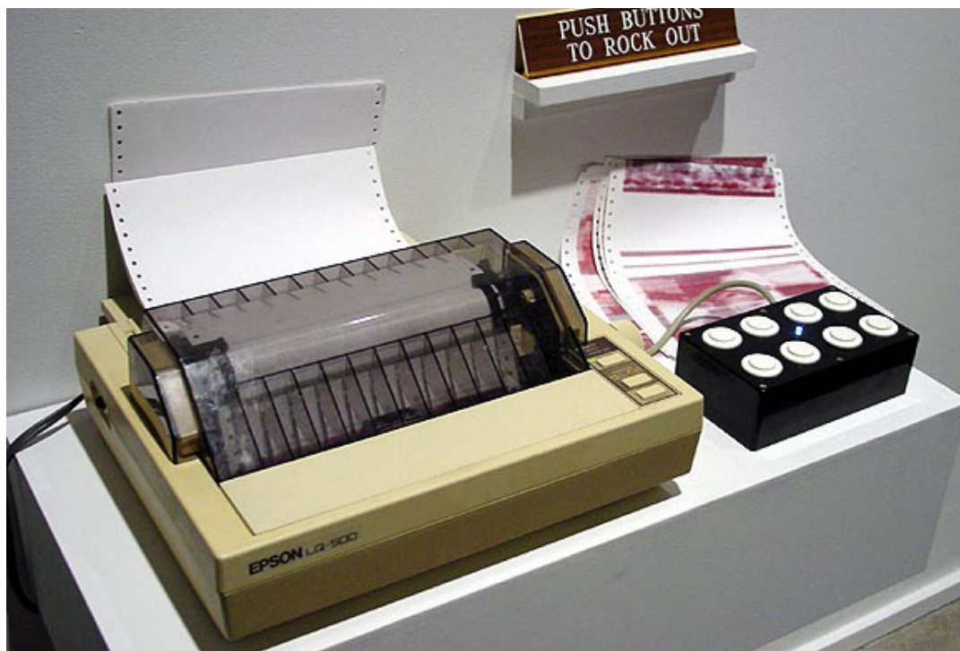
Fig.4 Slocum's Dot Matrix Synth , as exhibited at the New Museum of Contemporary Art

"The year is 2045, and my grandchildren (as yet unborn) are exploring the attic of my house (as yet unbought). They find a letter dated 1995 and a CD-ROM (compact disk). The letter claims that the disk contains a document that provides the key to obtaining my fortune (as yet unearned). My grandchildren are understandably excited, but they have never seen a CD before—