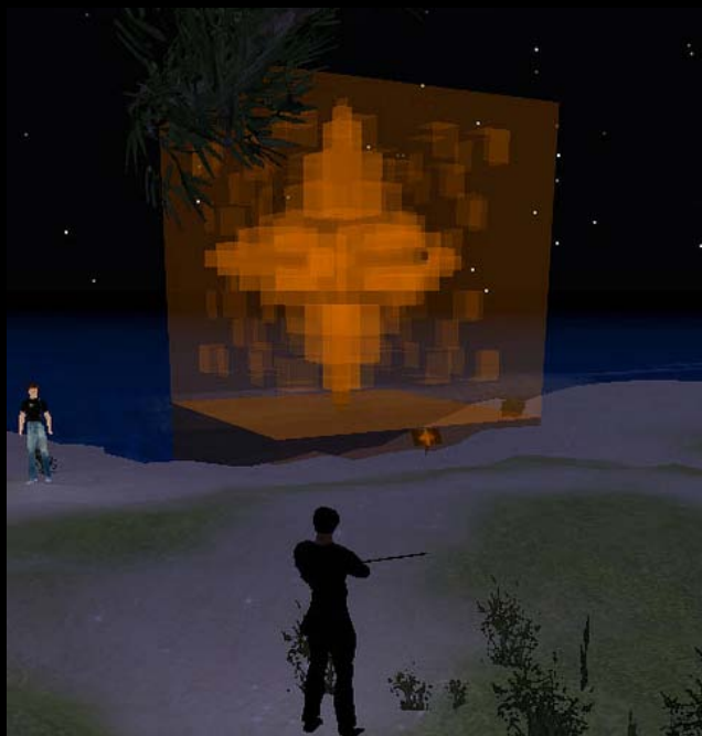
1) Arahata, The Mute Swan.

Trace Aureity – a small island covered with musical immersive sculptures.