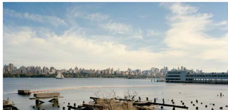
Quanta Resources Superfund, Bergen County, NJ