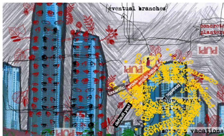
Scrape Scraperteeth: an art game about urban development, resembling a very messed up 2D platformer.

The phrase 'art game' means very different things to different people. True, some dismiss the whole idea as pretentious nonsense, the cynical appropriation of a mass entertainment platform by opportunist design students. But we'll ignore those views for now.