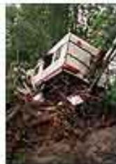
July 15, 1987, Le Grand-Bornand, Haute Savoie, France