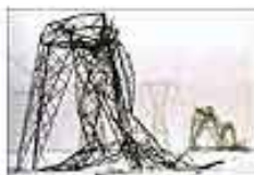
January 9, 1996, Montreal, Canada