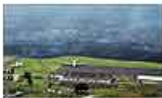
January 19, 2002, Goma Airport, Democratic Republic of Congo