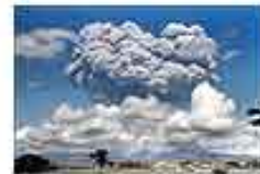
June 12 1991, Clark Air Base, Philippines