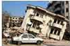
November 14, 1999, Duzce, Turkey