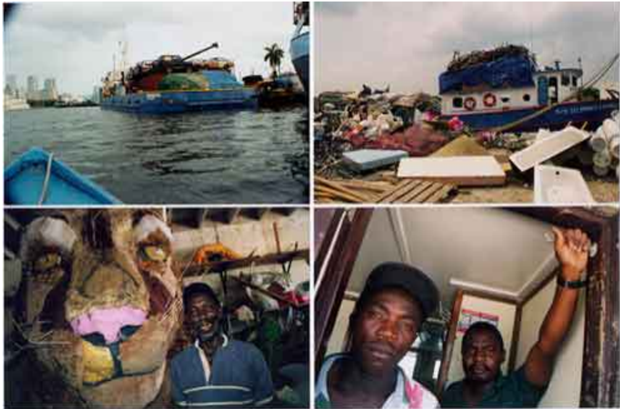
The Caribbean Code

History = the community story of the Miami River: the Haitian traders carry used mattresses back to Haiti for refurbishment and resale.