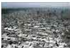
December 29, 1999, Nancy, France