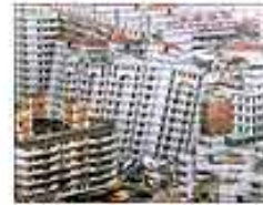
September 21, 1999, Wufeng, Taiwan