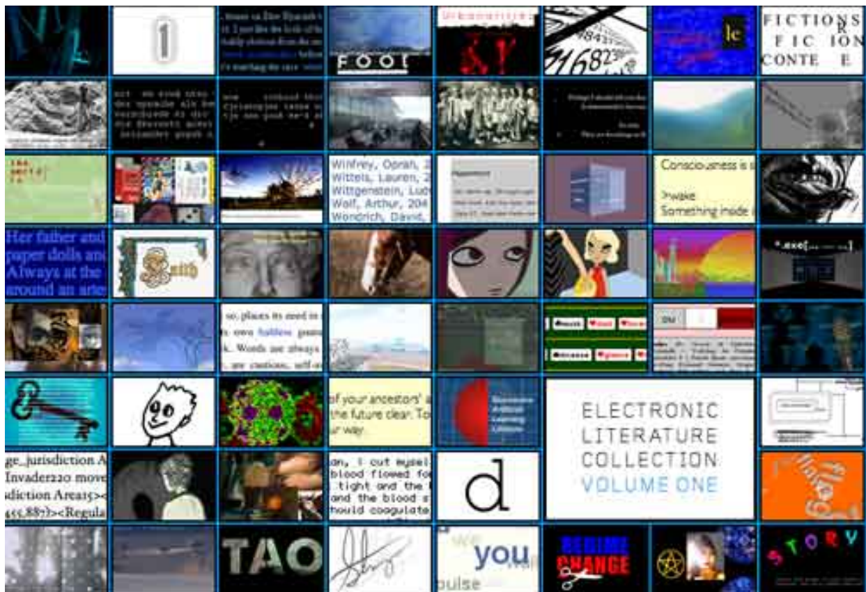
Electronic Literature Collection

I teach an upper-division undergraduate course called Internet Literature in an English department. About two-thirds of the students are English majors, and the rest mostly Journalism majors with other miscellaneous areas represented (Art, Business, Psychology often included). We meet in a networked classroom, justified by the fact that until recently students composed websites, following the principle that it is helpful in learning about new media to express your experience multimodally. Now the projects are composed as blogs, supplemented with basic Photoshop. In the context of an English department, or at least the one at the University of Florida, this modest bit of online authoring comes as a shock to many of the majors, whose standard expectation is the research paper. Our assignment is called the "learning screen," to make explicit the contrast with the conventional paper.