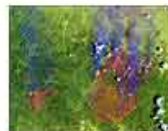
June 28, 2002, Phoenix, Arizona, United States