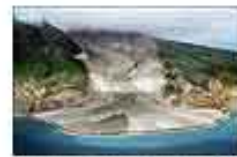
August 20, 1997, the Soufrière, Montserrat