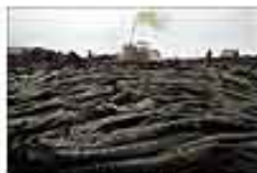
January 26, 2002, Goma, Democratic Republic of Congo