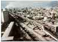
January 17, 1995, Nishinomiya, Japan