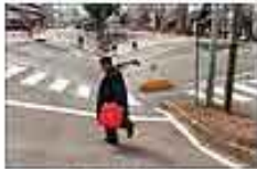
January 24, 1995, Kobe, Japan