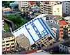
September 21, 1999, Wufeng, Taiwan