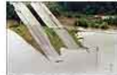
July 31, 1993, Chesterfield, Missouri, United States