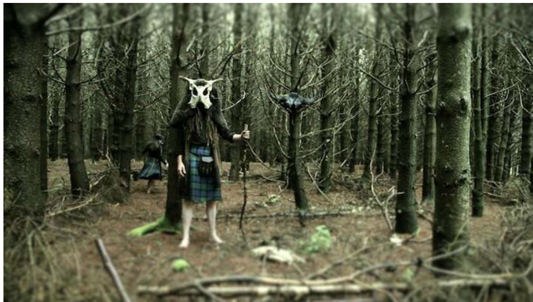
Valley of the Deer, Single Channel BluRay Video, 48:30 minutes, 2013