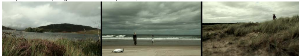
Valley of the Deer, Single Channel BluRay Video, 48:30 minutes, 2013

The Scottish woodland and farms lend themselves to a romanticized, mythic pastoral imbued with ominous foreshadowing, in full realization of the cinematic power to give landscapes a psychic emotional connection to the viewer. McDonald plays up a magical realism with muted wide shots of vast land, and a haunting soundtrack.