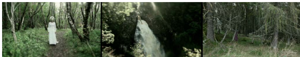
Valley of the Deer, Single Channel BluRay Video, 48:30 minutes, 2013

The actors, standing solitarily or slowly ambling toward the screen, confirm there is something scary about people in animal masks (if the Hollywood blockbuster "You're Next" hadn't already done that for you—though I can never be too terrified of anything with a title that requires such careful grammar.)