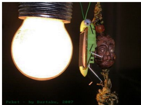
Figure 1: Peket - Part of Agit A/R , an installation work by Bartaku based on experiences in RDC

Kinshasa, RDC, 2006 - The electricity infrastructure of the capital of the Democratic Republic of Congo dates back to colonial times. Power cuts or absence of electrical power are a major issue today in this urban jungled sprawl, as it is inhabited by over 8 million souls. As a consequence, creative entrepreneurs connect wires to the main electricity cables pending above the ground, in order to 'rent' the energy further to nearby households. These wires are often lying on the ground open and unprotected, posing a life-threatening danger adding up to the courageous connectivity maneuvers. However, the highest numbers of casualties caused by these micro-economic activities occur when the tropical rains are turning the cities' 'roads' into tiny rivers, freezing most of the means of transport. Consequently people have to walk back home -often at night in the dark- wading through these open gutters. As the electricity wires have become invisible, one estimates that at least a dozen of people get electrocuted at every downpour. An image which gets superpositioned by the one of Topsy the elephant, who was electrocuted 105 years ago by [DC] Thomas Edison who tried to prove George Westinghouse and Nikola Tesla's alternating current (AC) was dangerous, whereas his competing direct current was completely safe. [1]