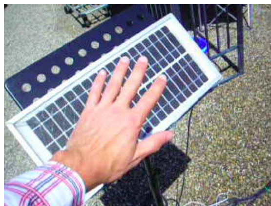
Figure 2: Controlling a water pump by interaction with solar panel at Intersolar 2007

Freiburg, Germany, 2007 - At the photovoltaic energy fair Intersolar , the middle path was occupied by the 'peripheral' products and services of the solar energy realm. In one of the stands –the most 'Confucian' one- water pumps were being sold. A demo set-up in front of the tent consisted of a black bucket filled with water and some tiny water pumps, and right next to it, an m-Si PV-panel. This lo-fi, poetic 'installation', became highly interactive whilst the sprinkling sweet water responded immediately to the gestures of the hand in front of the PV-panel. This vernacular 'experiment' demonstrated that a PV-panel can function as an actuator -a generator which transforms cosmic old light into electrical energy on the spot- and simultaneously as a light sensor that can be used as a (real-time) controller of an electricity powered device. In this responsive, locative media- context shade is being transformed from an enemy into an important ally.