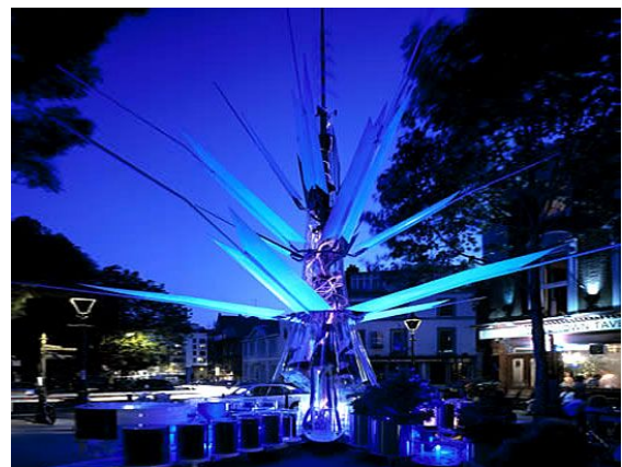
Figure 4: London Oasis. A kinetic 'growing flower' powered by wind/PV and a hydrogen fuel cell, created by Chetwood Associates.

working with aesthetic architecture to provide a tranquil space – an oasis for London. The 12 meter high kinetic structure mimics the design of a growing flower: its photovoltaic ‘petals’ open and close in response to the sun and moon utilizing daylight to generate power. This is supplemented by London’s first hydrogen fuel cell in a public area integrated with photovoltaics and a wind turbine, to make it self-sufficient. Rainwater is collected for irrigation and cooling air. At the base, the Oasis has five ‘pods’ inside which people will be secluded from the noisy and polluted surroundings, enjoying cleaner cooled air, and relaxing sounds. There are also further areas providing social rendez-vous and a stage for entertainment. www.thelondonoasis.com