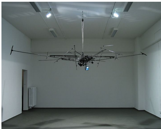
Figure 5: Drone #2. An Autonomous Observing System by Björn Schülke.

The only example of an indoor use of PV in this paper, is from Björn Schülke (Germany). Since 2000 he has been using photovoltaics for his kinetic sculptures and multimedia installations. His 'machines' combine elements of surveillance technologies, robotics interactive video and sound. Schülke's kinetic sculptures question the way in which we interact with modern technology: on entering the installation site, the audience becomes part of the 'system' as the works (some freestanding, others suspended) monitor or react to the human element. His electronic sound and video machines provide us with a sensory experience, yet one in which we are not always in control. Rather, it is the machines that react to or observe us.