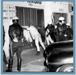
BEFORE THE 1950S, THE WHITENESS OF COMPTON WAS DEFENDED VEHEMENTLY