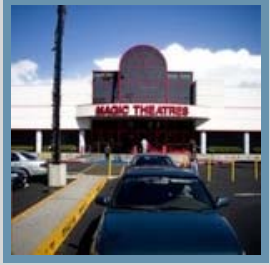
THAT NEW BLACK MAGIC