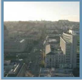
WELCOME GOVERNOR BROWN, BEST WISHES JUSTICE MORENO