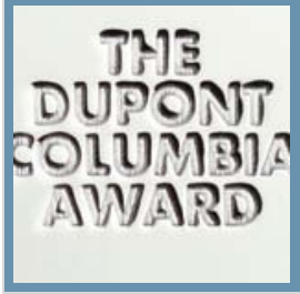
SOCAL WINS TV HONOR