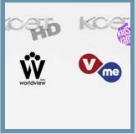
FREQUENTLY ASKED QUESTIONS: ABOUT THE NEW KCET